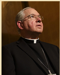
Most Reverend Jose Gomez Archbishop of Los Angeles President, United States Conference of Catholic Bishops